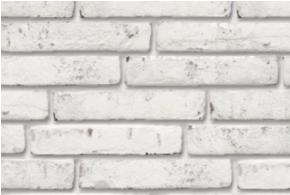
Imperium Albus Eco-brick RF ± 238x75x40 mm Eco-brick Iluzo ± 238x75x48 mm