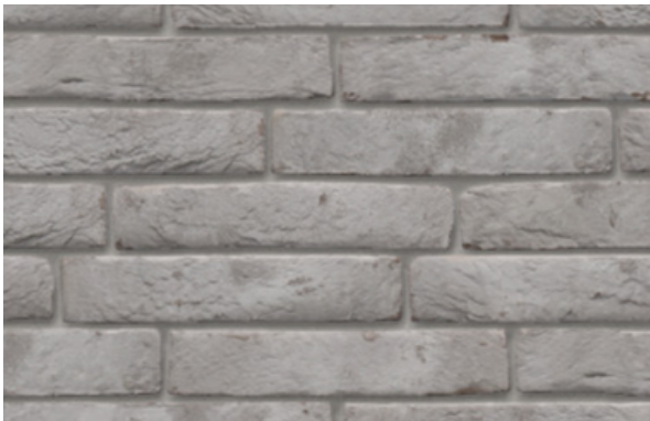
Imperium Notus Eco-brick RF + 238x75x40 mm Eco-brick Iluzo ± 238x75x48 mm