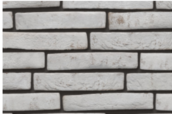
Imperium Flavius Eco-brick RF + 238x75x40 mm Eco-brick Iluzo ± 238x75x48 mm