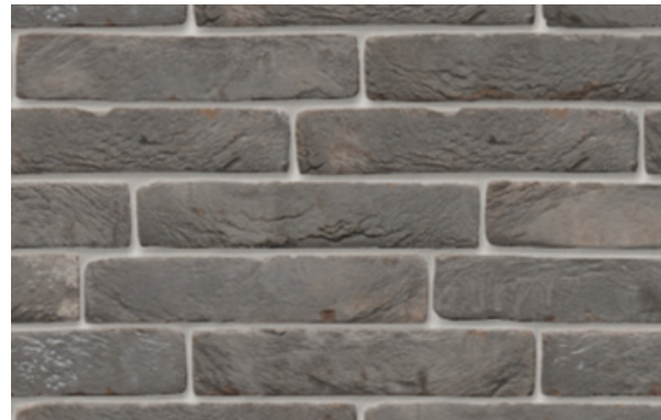
Imperium Nerus Eco-brick RF + 238x75x40 mm Eco-brick Iluzo ± 238x75x48 mm