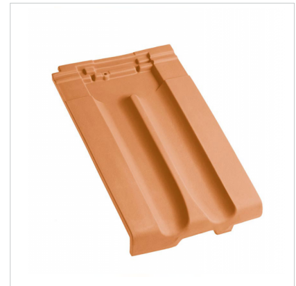
■ Gable tile left