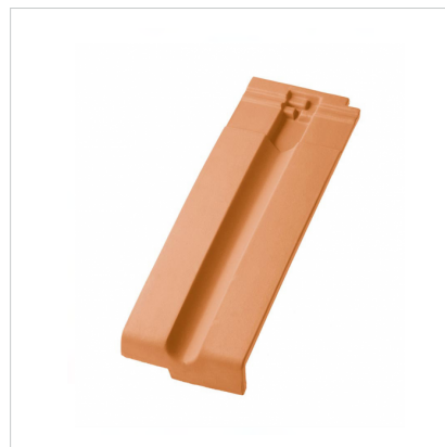
■ Half tile