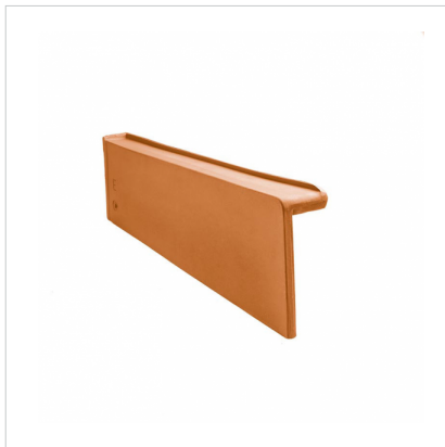
■ Barge tile left