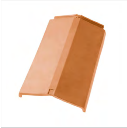
■ Ridge tile