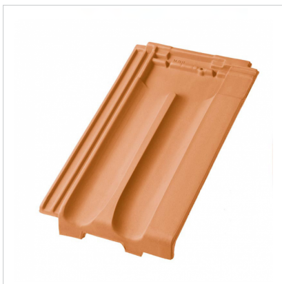
■ Gable tile right