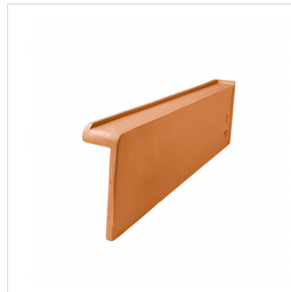
■ Barge tile right