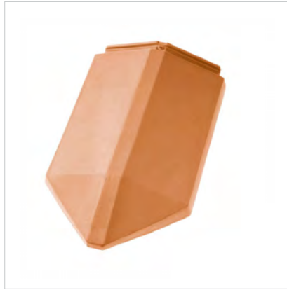
■ Hip starter