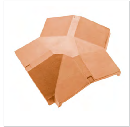
■ 3-way Apex