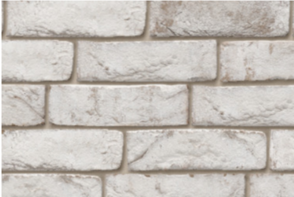
Nubilum Clarus Greige Eco-brick WF ± 215 x 65 x 50 mm Eco-brick WDF ± 215 x 65 x 65 mm

Porosity: ≤ 17% IW3 - normally absorbent