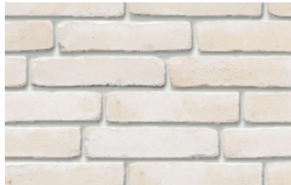
Nubilum Velum Beige Eco-brick WF ± 210 x 65 x 50 mm