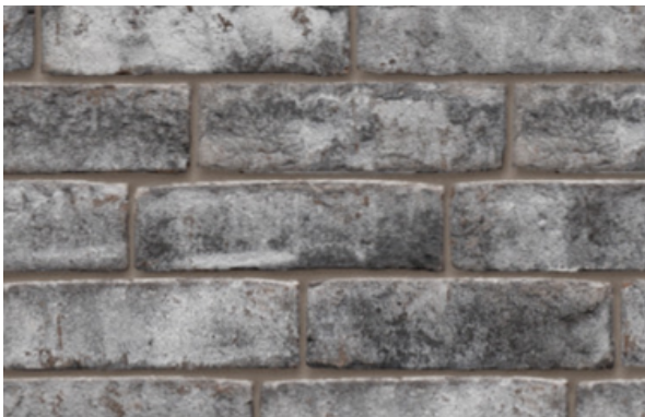
Nubilum Saturn Grey Eco-brick WF ± 215 x 65 x 50 mm Eco-brick WDF ± 215 x 65 x 65 mm