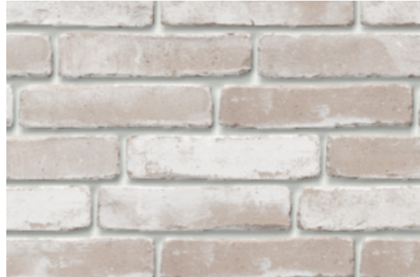
Nubilum Stratus Greige Eco-brick WF ± 210 x 65 x 50 mm

Porosity: ≤ 17% IW3 - normally absorbent